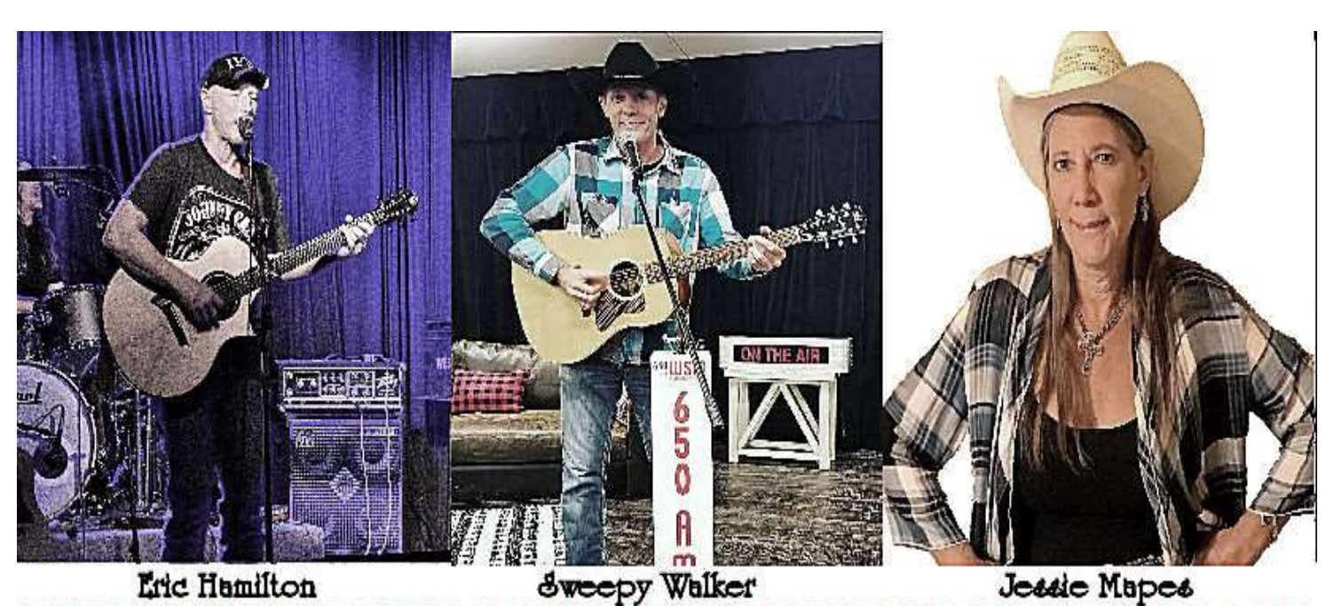
TWBFF AFTER PARTY AT THE CATTLEREST RV PARK & SALOON Willcox, AZ SUN OCT 4TH 10:30 PM TO 12:30AM - FREE CONCERT Willcox, AZ www.thewildbunchfilmfestival.com